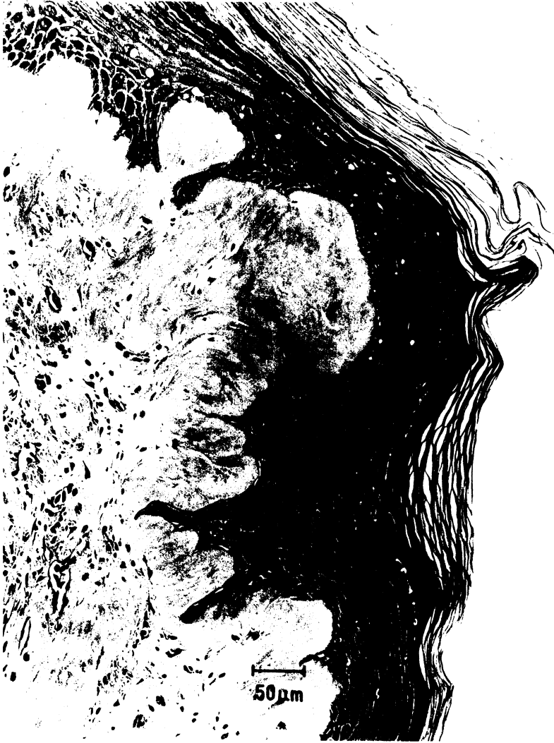
FIGURE 2.—Photomicrograph of fibropapilloma from a green turtle (64 cm curved carapace length) from the Dominican Republic.

mors on 86 other green turtles were examined grossly and appear to represent the same condition, but were not confirmed histologically (Table 2). One case typical of our examinations is described below.